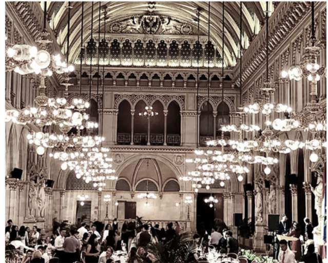
The splendor of the Festsaal, Rathaus of Vienna, Final's Banquet IBA-VIAC CDRC 2023