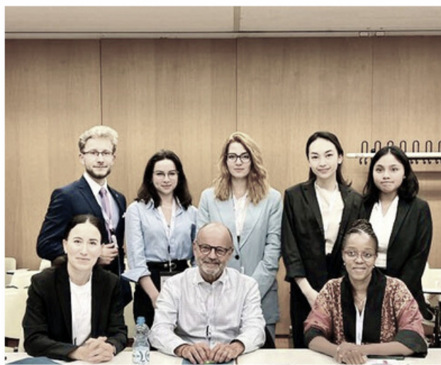
Competitors and Experts, IBA-VIAC CDRC 2023

World-leading dispute resolution experts assess the Mediator and Negotiator Teams. Our Expert