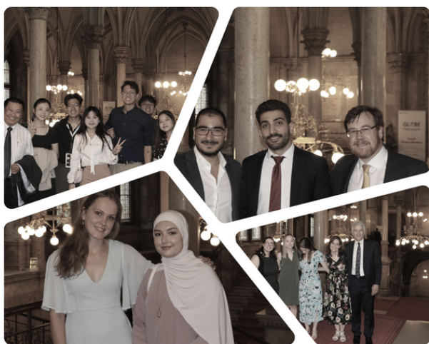
Impressions, Final's Banquet IBA-VIAC CDRC 2023

Since then, we have established a global platform that connects current and future experts. Our Moot mimics near-real mediation and negotiation experiences. We team up with top universities and institutions from all across the world and offer one of the best learning and networking experiences for ADR enthusiasts worldwide. The IBA-VIAC CDRC now sets the trend for a totally fresh generation of handling disagreements, a whole new era of dispute resolution where parties take control over resolving their disputes as we continue to: